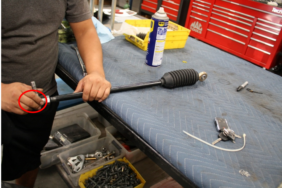
Figure 1A: Remove this tie rod end and install dust boot from here.