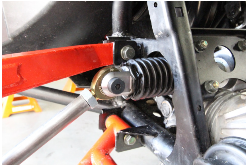
Figure 4: inner rod end attached to clevis, and dust boot tied to clevis groove.