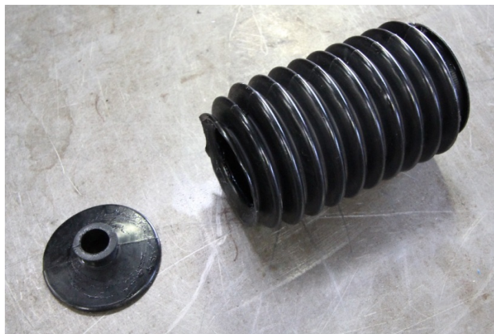
Figure 3: trim the small end off the dust boots, so it can be attached to the clevis groove.