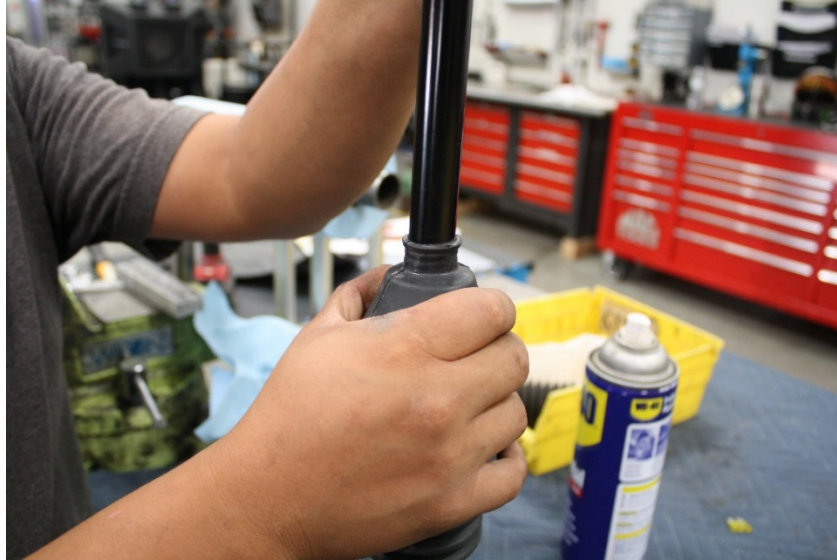
Figure 3C: Pull boot down