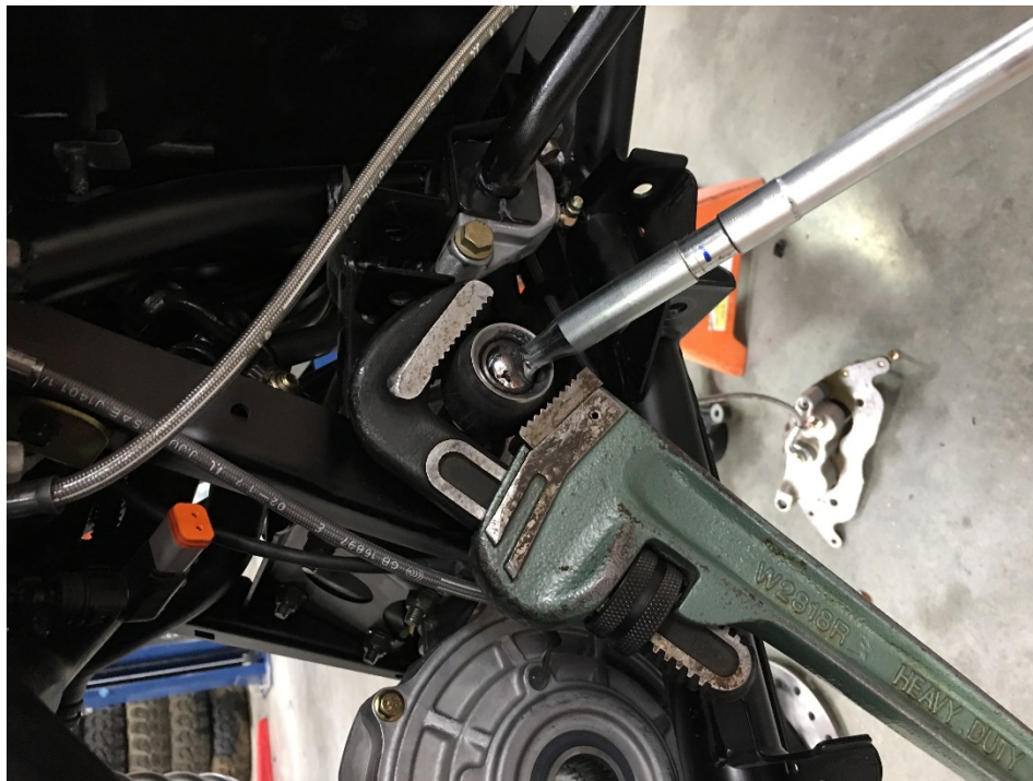
Figure 1: pull dust boot back, remove inner tie rod from rack bar.