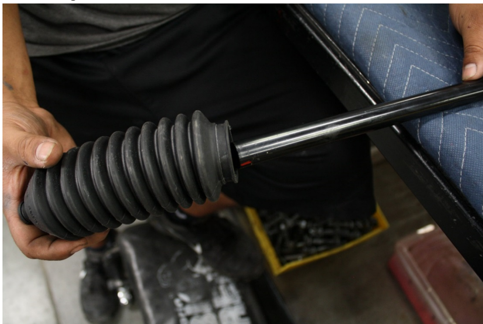
Figure 2B: Install boot