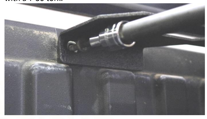
Repeat on the opposite side.

Line up the bracket with the front wall holes, and secure it with 2 of the factory bolts and washers, with a T-30 torx.