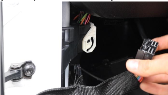
Next, remove the Torx bolt from the door hinges.

Begin by disconnecting each door's electrical connector, and unhooking the door strap. We recommend you roll your windows down before you do this, to make it easier to carry the doors.