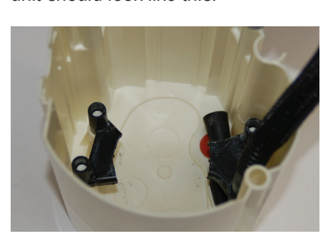
Step 14 Once bridge has been cut, sending unit should look like this.