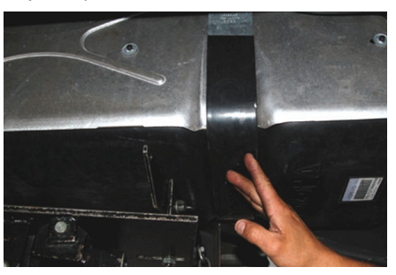
Step 4 Disconnect return and fill lines by disconnecting fuel line clips.

Remove tank straps (Use jack to hold in place).