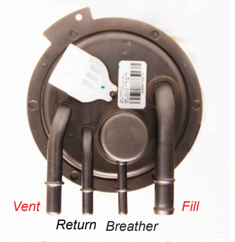
Modified sending unit configuration