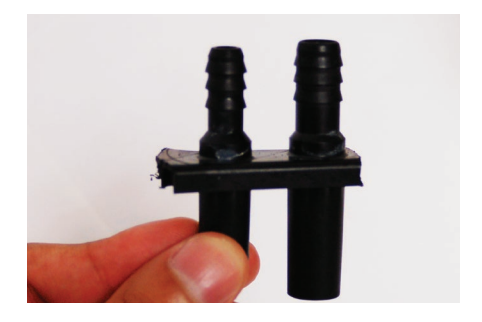
Step 15 Drill .09375 (3/32in.)screw holes through plastic using fuel pick up as a guide.