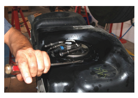
Step 9 Remove sending unit from fuel tank (Be sure to drain fuel).