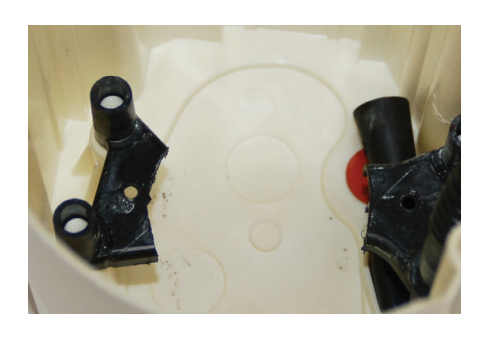
Step 18 Install fuel pickup using screws and lock washers(Do not over tighten screws)