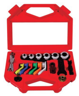
GM Fuel Line Disconnect Tool (Matco Set Pictured)

NOTE: Before beginning installation, you will need two disconnect tools for fuel lines. The BLUE tool in the figure below corresponds to 3/8" diameter and is used to remove the return line; the RED tool in the figure below corresponds to 1/2" diameter and is used to remove the fill line. You can purchase these tools at any auto parts store or Snap-on, Mac or Matco.