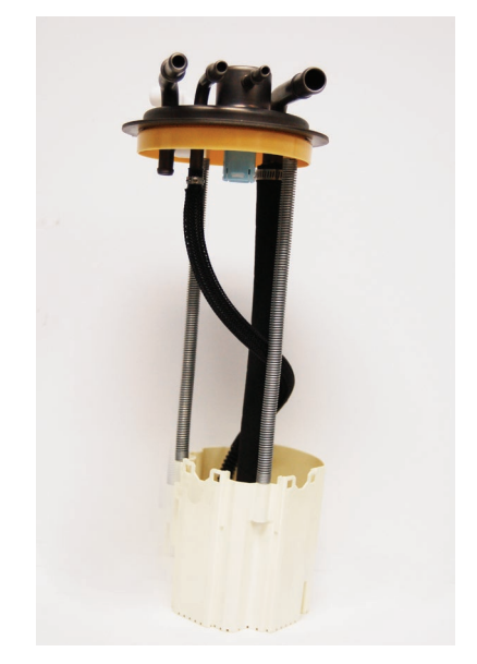
Step 22 Fuel and vent lines need to be routed as pictured below.

Note: GM sending unit is spring loaded and not fixed in length, 5/8in. pickup hose affects installed height of sending unit. Length of 5/8in. hose may vary depending on the depth of fuel tank. Refer to steps 19-20.