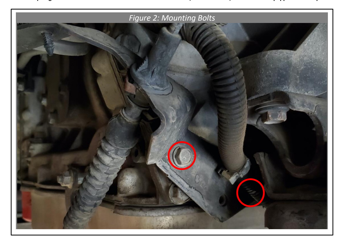
Install Sheet #7063 | Cognito Allison Transmission Bracket For 06-19 Silverado/Sierra 2500HD/3500HD 4WD Equipped With 6 Speed Allison Only

3. Using the 2 bolts removed in the previous step, install the Cognito Bracket just as the OEM bracket was installed. Reinstall the shift cable, safety clip, hose-stays, and wire-stays removed in step 1. See figure 3