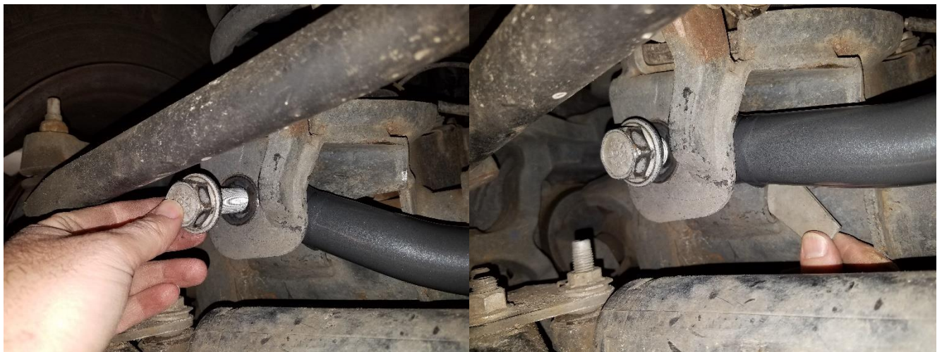
Figure 4. Installing the Axle End Bolt

5. Install the new Synergy Ram HD Front Track Bar. Install the non-adjustable side of the track bar into the axle bracket with the bend on that side facing down (the pinch bolt on the frame side will be facing down). Partially install the track bar bolt. It is easiest to thread the track bar flag nut on if the track bar bolt is not fully seated. Hold the flag nut by the flag and rotate the track bar bolt into the mount and nut. Once the nut has started on the bolt continue to rotate the bolt in. See Figures 4 and 5 .