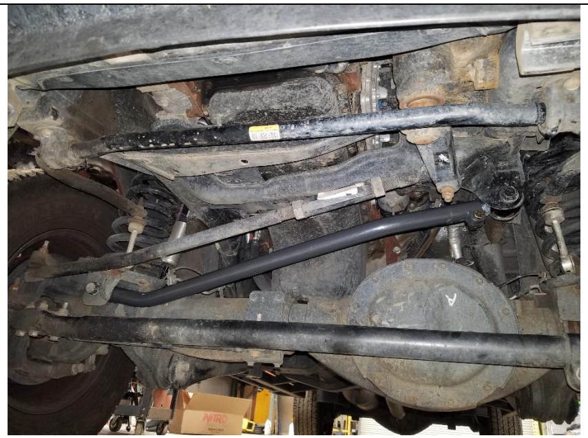
Figure 13. Completed Installation