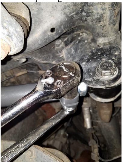
Figure 12. Tightening Pinch Bolt.

9. Install the 1/2" pinch bolt through the hole in the forging of the track bar, with the bolt head towards the front of the vehicle, the nut towards the rear. With a 3/4" socket and wrench, tighten the pinch bolt to 90 lb-ft. Check to make sure the pinch bolt has adequately clamped the double adjuster assembly and there is no movement when putting a wrench on the adjuster sleeve. See Figure 12 .