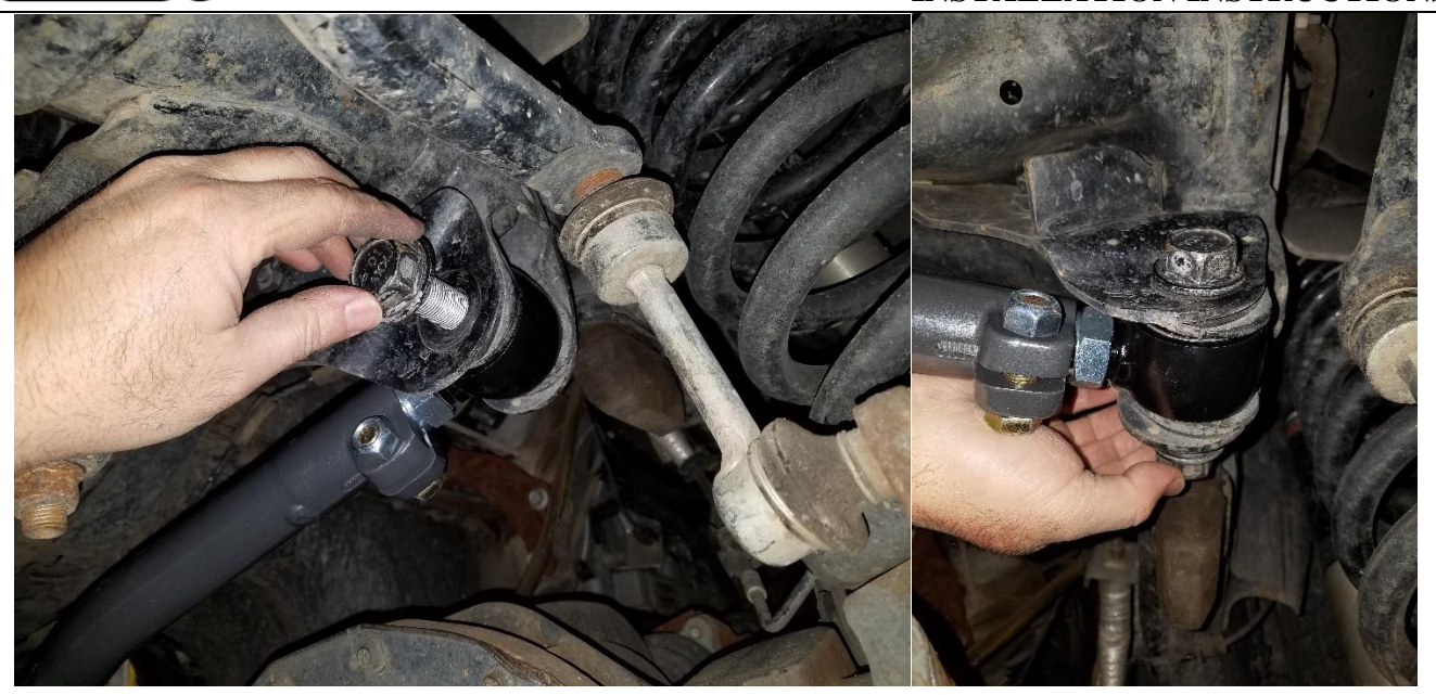
Figure 6. Installing the Frame Side Bolt