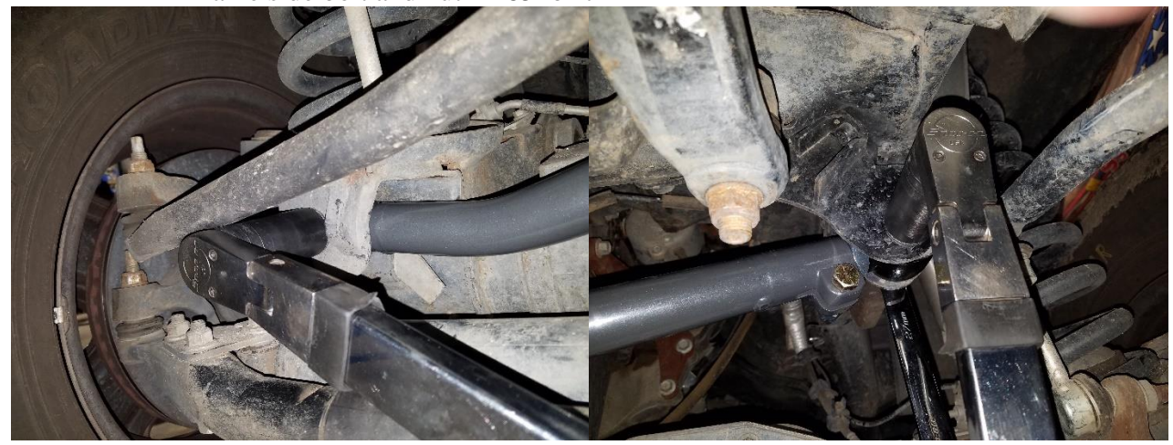
Figure 8. Torqueing Axle Side Bolt