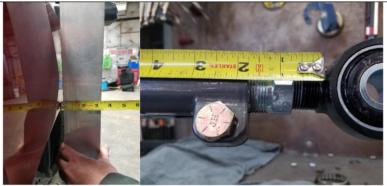
Figure 10. Measuring Axle Side to Side