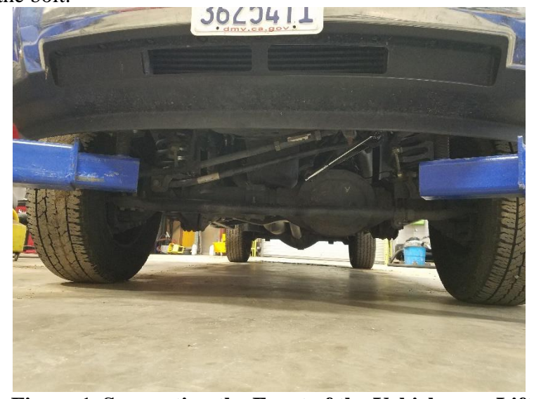
Figure 1. Supporting the Front of the Vehicle on a Lift