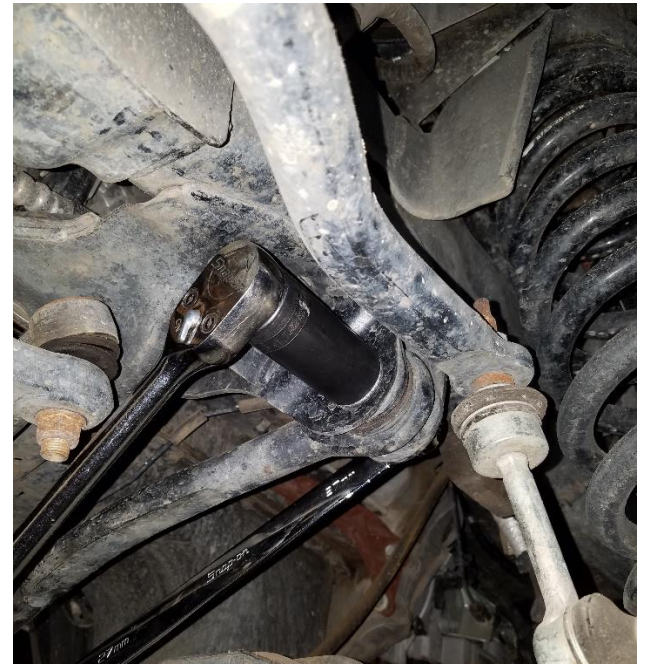
Figure 3. Unbolting the Frame Side of the Front Track Bar

4. Use the same 27mm socket and ratchet to remove the frame side track bar bolt. Early trucks need a 27mm wrench for the nut on the back side, later trucks use another flag nut and consequently do not need a wrench. Make sure to support the track bar as you remove the bolt so it does not fall out of the mount. Completely remove the front track bar from the truck. Save the stock hardware as it will be re-used. See Figure 3 .