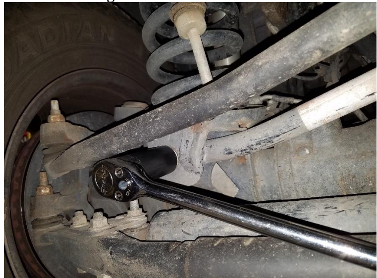
Figure 2. Unbolting the Axle Side of the Front Track Bar

3. Use a 27mm socket and ratchet (or impact) to loosen and remove the axle side track bar bolt. Either lift the truck up or steer the truck to the pass side to get the drag link to clear the bolt as it comes out. Make sure not to lose the flag nut that secures the bolt on the back side of the bracket. Save the stock hardware as it will be re-used. See Figure 2 .