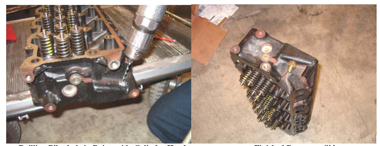
Drilling Pilot hole in Driver side Cylinder Head

1. Reference the supplied photo for location of coolant return fitting. Drill pilot hole in desired location, progressively drill to a size of 7/16". Tap hole with 1/4-18" NPT tap. Install fitting with thread sealant. Perform operation to other cylinder head.