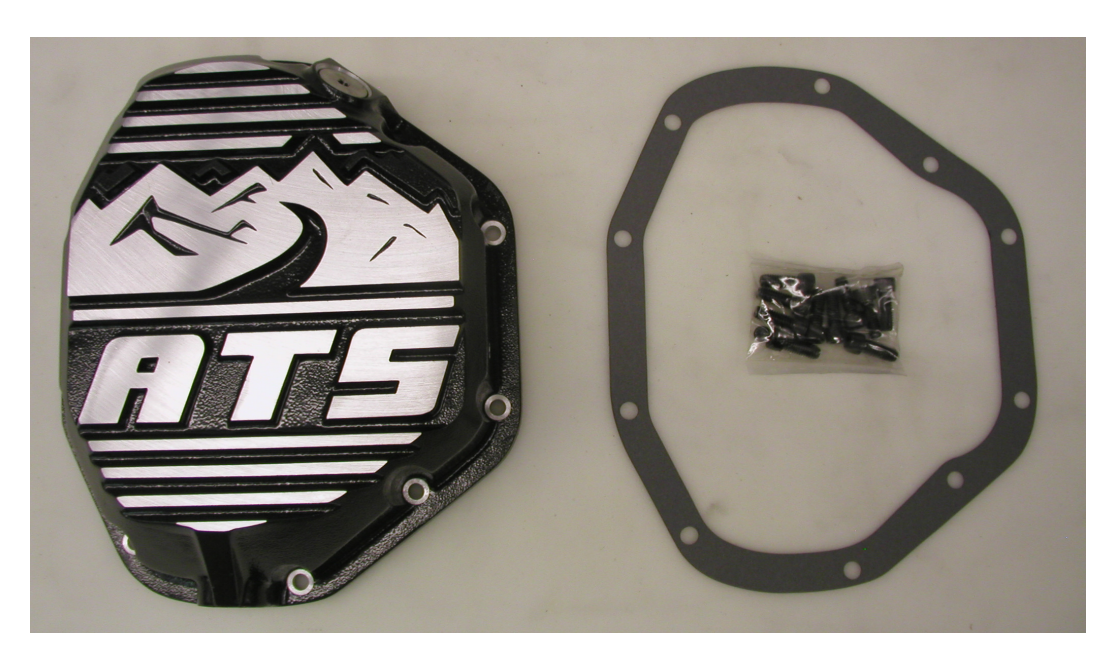
Figure 1: Dana 80 ATS Protector Differential Cover Kit

For some installations, removing the spare tire may provide better access to the work area. It is not necessary in every case. The installer should determine if there is adequate workspace prior to starting the installation.