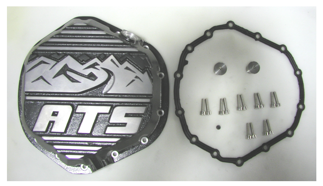
Figure 1: GM/Dodge ATS Protector Differential Cover Kit

For some installations, removing the spare tire may provide better access to the work area. It is not necessary in every case. The installer should determine if there is adequate workspace prior to starting the installation.