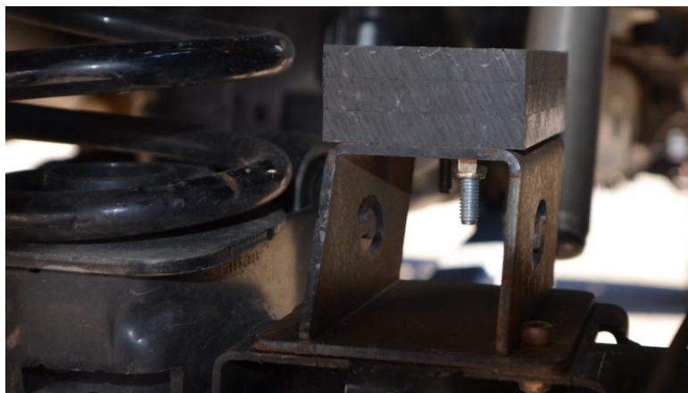
Figure 3: Installation photo (1.5" of bump stop used)