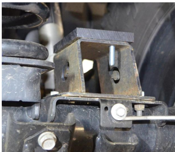
Figure 1: Extension located on bump stop perch with bolts dropped in holes

Locate the holes on the top of the bump stop perch. Align the holes in the bump stop extensions and use the supplied 5/16" countersunk hardware and locknuts to fasten the extension to the perch.