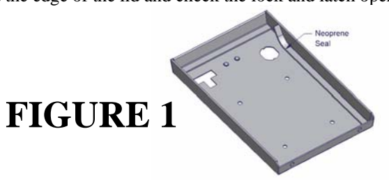
Page 1 of 2 - 01/28/2008 - Rev02152006

1. Install the rubber seal around the edge of the lid and check the lock and latch operation. (See Figure 1)