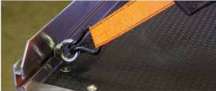
Tie Down Bolts