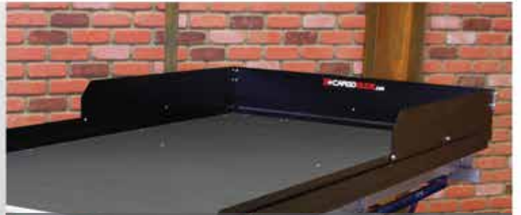
High Sides Powder