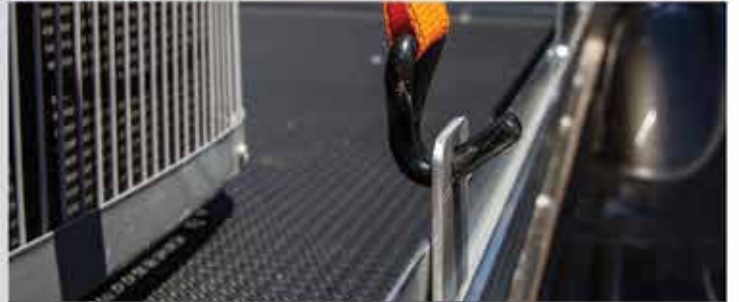
Outside Tie Downs