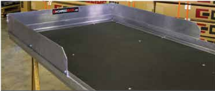
Aluminum High Sides