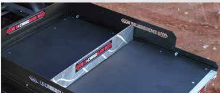
Cargo Divider Burnished